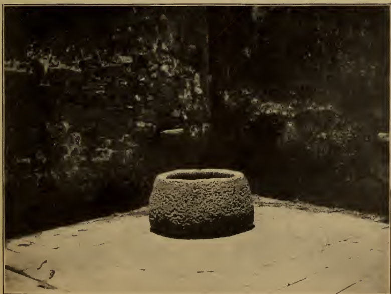
A DETAIL—THE VILLAGE WELL.